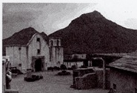
The Golden Gate Peak makes a great background to The Old Tucson Studios in Tucson. In the foreground is "The Mission" set, where gun shows are put on for visitors.

The rock formations found at Chiricahua National Monument are striking towers of stone that seem like a forest of rock sculptures. The warrior chief Cochise and his Apache followers roamed this territory years ago. It's been said that when Cochise died he was buried in Stronghold Canyon where his followers ran their horses up and down the canyon trails to erase all traces of the grave.